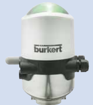
Control Head 8681 with coloured status indication