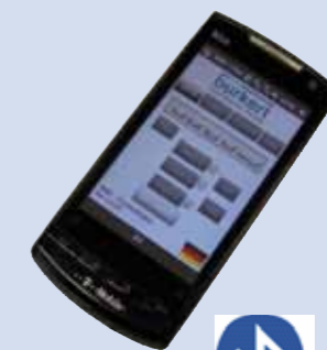
Parametrization/configuration and maintenance function via smartphone