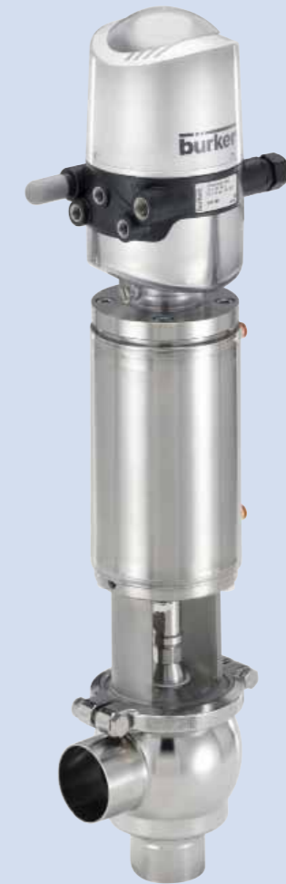
Hygienic Process valves decentrally automated